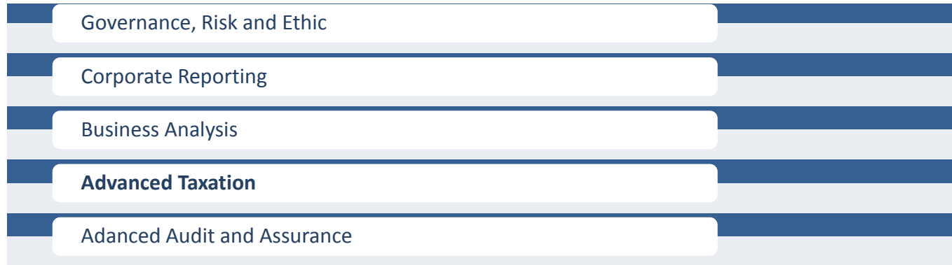
Diagram.2: CEA Certified External Auditor Qualification Level Modules

CEA Certified External Auditor Qualification Level consists of five modules and is mandatory to pass all five in order to obtain the title: